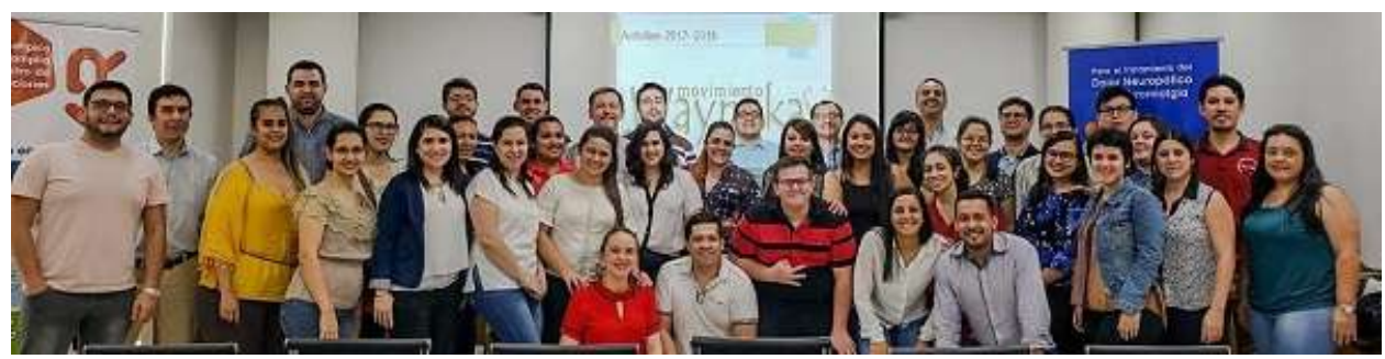
underway to maintain active participation.

On Saturday November 16th, the second YDM meeting took place in Paraguay, where hard work is